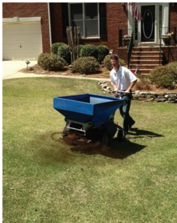
Periodic applications of compost topdressing add organic matter to lawns and enhance soil health and turfgrass vitality.