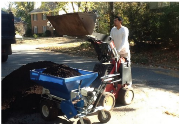
Compost can be produced from any biodegradable organic matter. It pays to access compost from an experienced compost producer.

Soil structure is comprised of four basic materials, which are sand, silt, clay and organic matter (OM). So from a topdressing amendment point of view, our topdressing materials then are sand, silt, clay and OM (compost) or any blends of these.