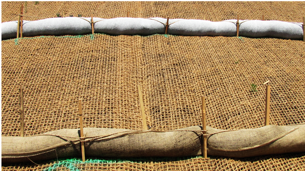
Figure 5 - Utilization of compost socks on slope in California

Now in the nitrogen column , part of the Drawdown series, I used an estimate of 27.6 million acres of irrigated farmland that could use compost. That didn't count the forestry acreage in California (33 million). It also doesn't take into account the quantity of compost that people like me want for their tomatoes and their lawns. In short, using compost for highway right of ways is a great end use, one that would help state budgets and reduce headaches for roadway landscape architects. In all likelihood, it would even been good for those stuck in traffic, having something nice to look at on the side of the road. Getting these people who work within a jungle of regulations and are