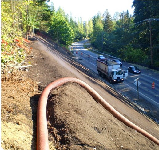
Figure 3 - Opening photo (top of page): Slope with completed treatments and temporary irrigation system. (Above) Application of compost blanket

If composters start upping their game, the situation can change rapidly. Once landscape architects started using specialized compost products like blankets and socks, use increased rapidly. From 2010 to 2015 over 15,000 yards of socks have been used. California — despite very high use relative to WA and TX when considered on an acre right of way basis — still has a long way to go.