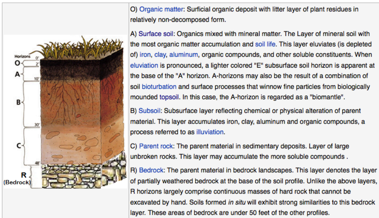
Figure 1 – Soil horizon characteristics.

If soil health is key to sustainability then implementation can be engineered into reclamation and restoration projects such as abandoned mine lands or infrastructure right-of-ways such as pipelines and roads. To obtain such a goal requires an understanding of soil characteristics and their relationship to land use, plant growth and environmental quality. Figure 1 summarizes soil characteristics in which the Organic (O) layer represents the top two inches and the surface soil layer (‘A’ horizon) can be up to a foot deep. Based on USDA soil texture (Figure 2), the optimal formulation for the ‘A’ horizon of a healthy soil is silty loam containing 15% clay, 15% sand and 70% silt.